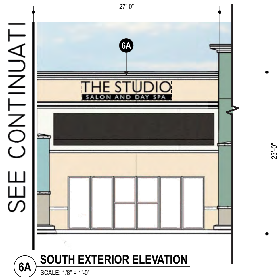
6A SOUTH EXTERIOR ELEVATION SCALE: 1/8" = 1'-0"